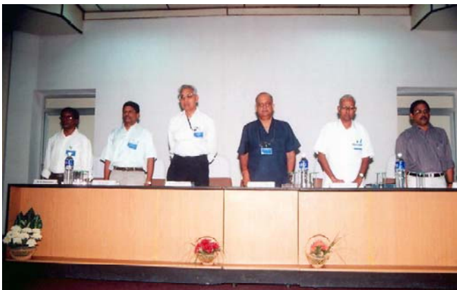
Terzaghi Day 2005 inaugural function - October 1, 2005

The Executive Committee meeting of Indian Geotechnical Society took place after the workshop.